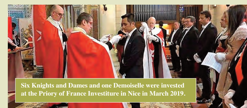
Six Knights and Dames and one Demoiselle were invested at the Priory of France Investiture in Nice in March 2019.