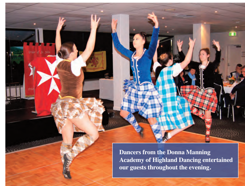
Dancers from the Donna Manning Academy of Highland Dancing entertained our guests throughout the evening.