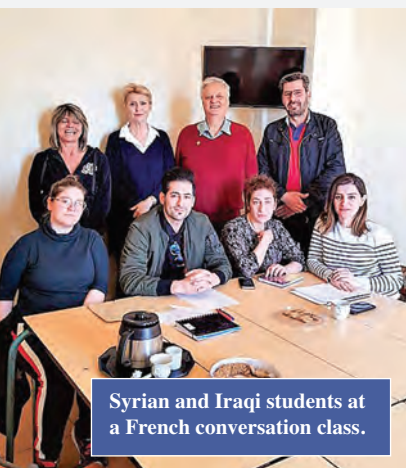
Syrian and Iraqi students at a French conversation class.