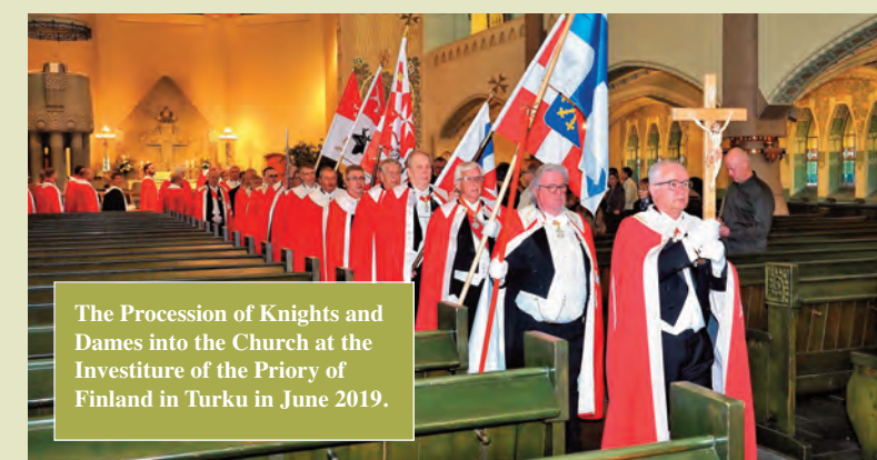
The Procession of Knights and Dames into the Church at the Investiture of the Priory of Finland in Turku in June 2019.