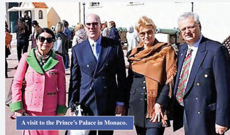
A visit to the Prince's Palace in Monaco.

Four of our refugees, who participate in our French courses, were working on the stand that