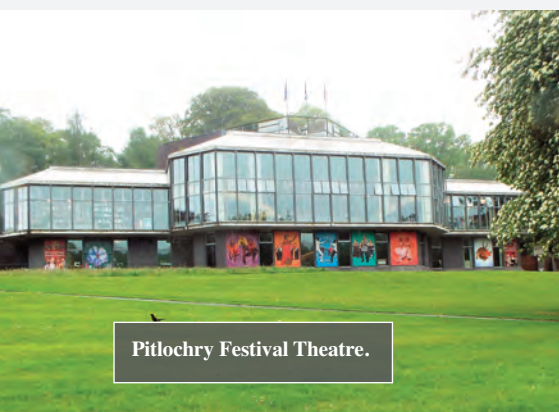
Pitlochry Festival Theatre.