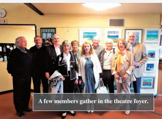
A few members gather in the theatre foyer.

On Saturday 25th May, a number of our members decided to enjoy a great social day out and travelled north to Pitlochry in Perthshire, to visit Pitlochry Festival Theatre and attend a performance of "Summer Holiday", the musical made famous by Cliff Richard and the Shadows who starred in the film of that same name. We arrived at the theatre in good time to enjoy a convivial lunch before the performance began at 2.00pm. It was a highly successful social occasion and, despite the atrocious weather, we all had a thoroughly great day enjoying the company of our fellow Knights and Dames.