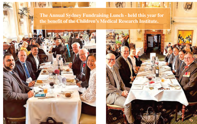
The Annual Sydney Fundraising Lunch - held this year for the benefit of the Children's Medical Research Institute.