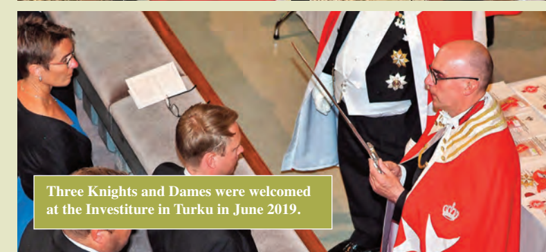
Three Knights and Dames were welcomed at the Investiture in Turku in June 2019.