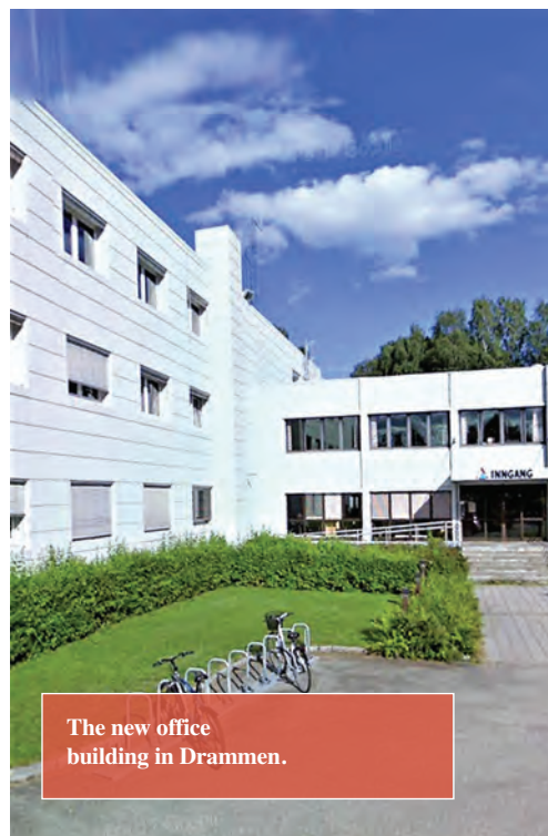
The new office building in Drammen.

Although I will be stepping down as Grand Councillor at the Sovereign Council Meeting, I will continue as Secretary for Medals and Insignia. In addition, it has been decided that our Order should have a proper office base, and I have been asked to set up an office in Norway. The new office will be situated in Drammen, which is some 30 miles southwest of Oslo and should be operational by the end of September. However, further information will be issued in due course. The address of the office is Øvre Eikervei 14, NO-3048, Drammen and once all documents and papers have been transferred from Bedfordshire to Drammen they will be scanned, digitised and logged. I will manage the office and