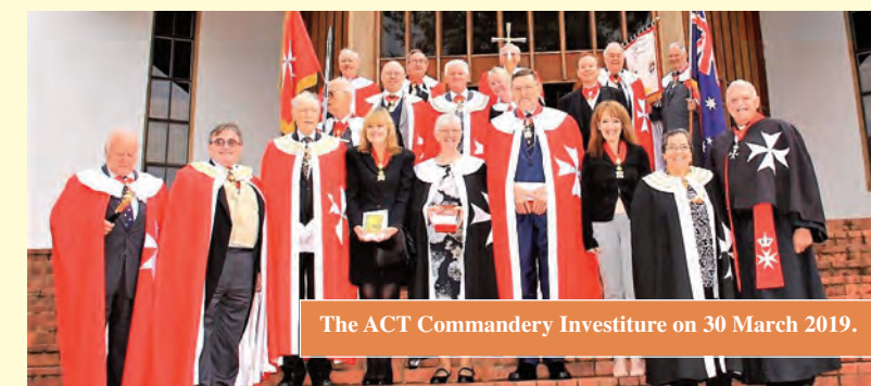
The ACT Commandery Investiture on 30 March 2019.

The ACT Commandery continues to evolve in our Nation's Capital. Although we have had no formal functions since our Investiture on 30 March, we continue to advance our cause, and since most of us are regularly in and around the City Centre, either for business reasons or for medical or dental appointments, we often meet up for a coffee and a chat.