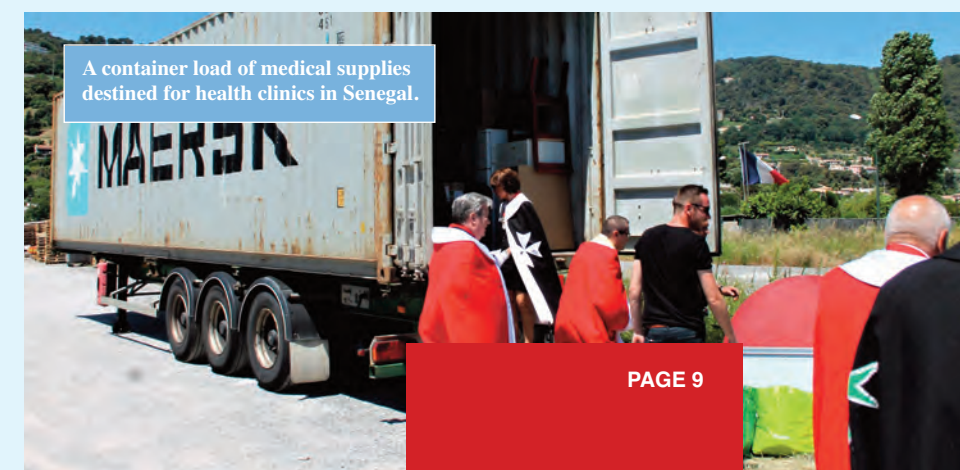
A container load of medical supplies destined for health clinics in Senegal.