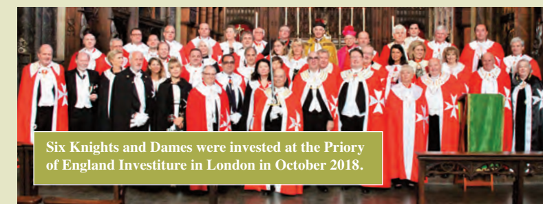
Six Knights and Dames were invested at the Priory of England Investiture in London in October 2018.