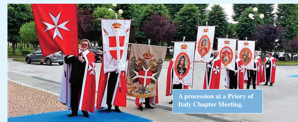
A procession at a Priory of Italy Chapter Meeting.