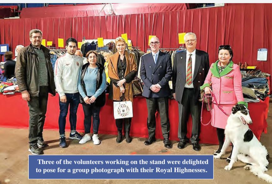
Three of the volunteers working on the stand were delighted to pose for a group photograph with their Royal Highnesses.