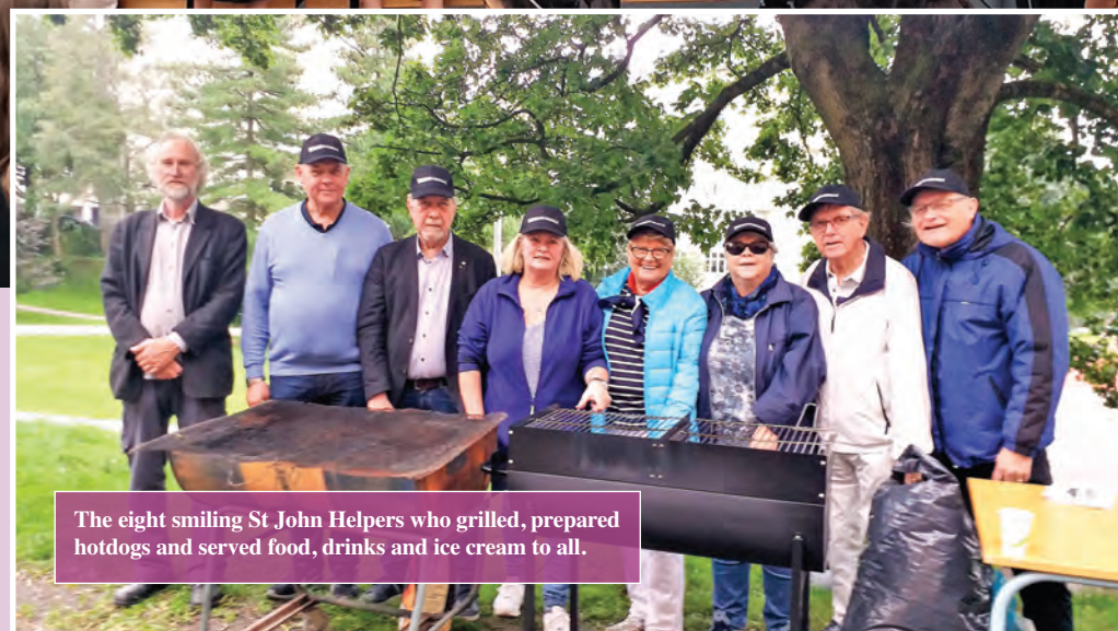
The eight smiling St John Helpers who grilled, prepared hotdogs and served food, drinks and ice cream to all.

Despite the light rain and changeable weather, lots of people showed up at the church for the party. To stay dry the musicians performed beneath a tent, so all three choirs were accompanied by the music essential for their performances. The three choirs were Stas, Song Choir Major and the church's own choir,