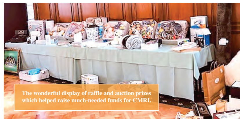
The wonderful display of raffle and auction prizes which helped raise much-needed funds for CMRI.

I am delighted to report that the Priory of NSW & the ACT had a very successful Annual Sydney Fundraising Lunch, which this year was held for the benefit of the Children's Medical Research Institute (CMRI), who are celebrating their sixtieth year of operation. The lunch was held on Thursday 25th July in the historic Castlereagh Boutique Hotel, and this year we were privileged to not only have a representative from CMRI as our main guest speaker, but a number of other scientists and medical professionals were in attendance.