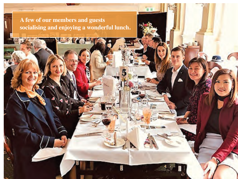
A few of our members and guests socialising and enjoying a wonderful lunch.