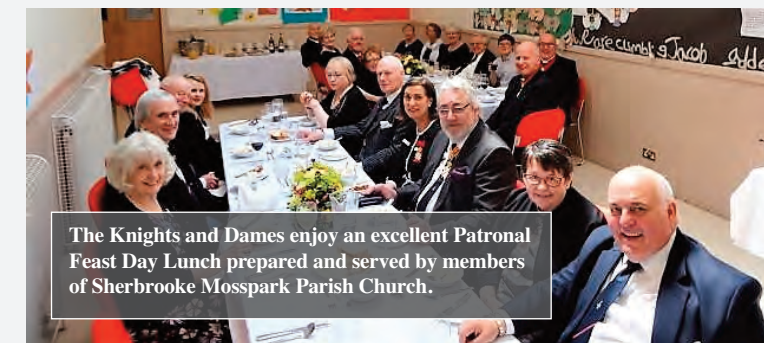
The Knights and Dames enjoy an excellent Patronal Feast Day Lunch prepared and served by members of Sherbrooke Mossspark Parish Church.