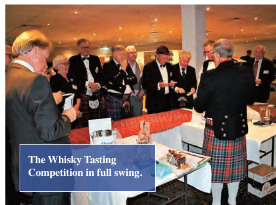
The Whisky Tasting Competition in full swing.