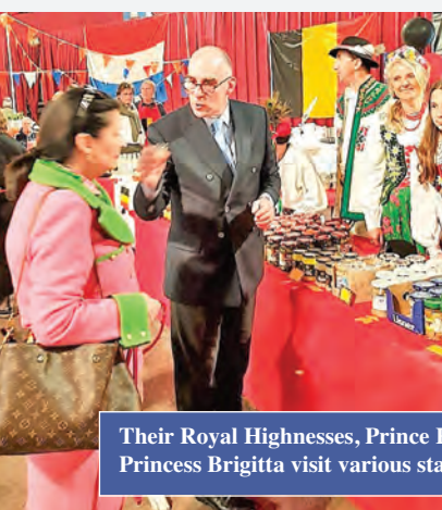
Their Royal Highnesses, Prince Karl Vladimir and Princess Brigitta visit various stands at the Fair.